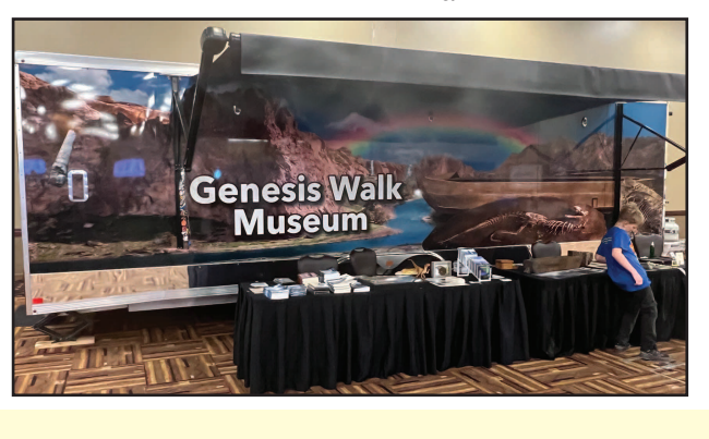
Mobile Creation Museum!

For Dads and Teens — work together under the supervision of master builders and build a REAL HOUSE! All who work on the project will be entered in a drawing to WIN the house when it's completed! Achieve something together you never thought you could!